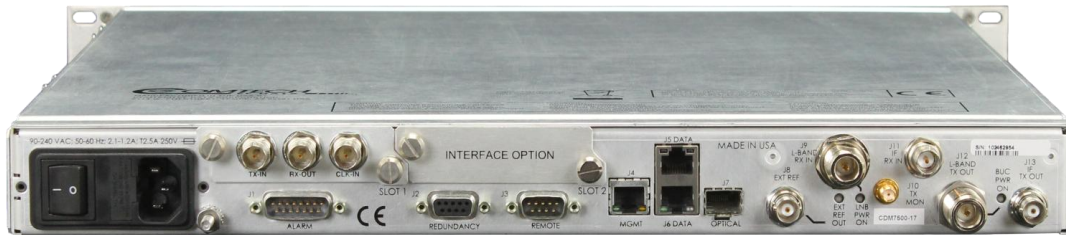
CDM-760 Back Panel