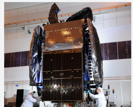
SES-8 in Orbital ATK's Dulles, Virginia satellite manufacturing facility