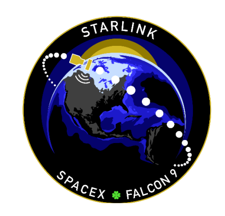
Official SpaceX Starlink-13 Mission Patch

Falcon 9's first stage previously supported launch of Crew Dragon's first flight to the International Space Station with NASA astronauts onboard and the ANASIS-II mission. Following stage separation, SpaceX will land Falcon 9's first stage on the "Of Course I Still Love You" droneship, which will be stationed in the Atlantic Ocean. One of Falcon 9's fairing halves supported two previous Starlink launches.